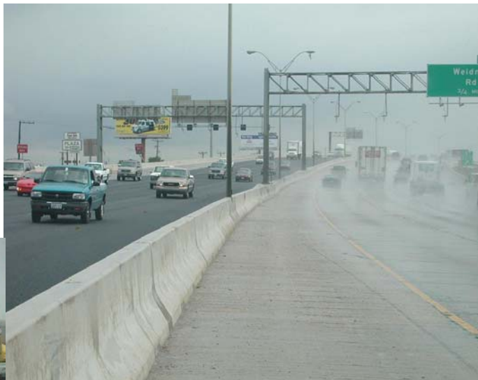
The photo above: I-35 in San Antonio, A-R on left and old concrete on right. The photo on the left shows an open surface in the far left lane where the water is not present at the tire pavement contact compared to a dense mix used in the rest of the lanes during a highway widening and resurfacing project.

Open mixes remove the water from the surface. Adding granulated tire rubber to these open mixes provides better skid resistance and durability. The increased visibility and skid resistance, reduced splash and spray and better ride can lessen the occurrence of accidents. Consider a case study from Texas.